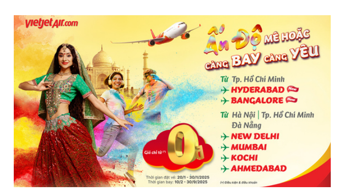
Lively India, the more you fly the more you fall in love, let's Vietjet!